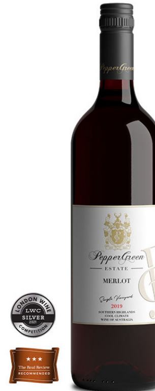
2019 Merlot Single Vineyard RRP $30

Pale red purple with a fragrant red cherry, red currant nose. A supple wine with plum red fruits finishing with a brush of soft tannin and refreshing acidity.