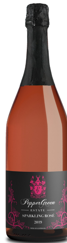
2018 Sparkling Rosé

Yellow golden colour. The nose shows fresh aromas of stone fruit with a hint of strawberries. Light bodied. The palate is zesty and crisp. This wine finishes clean and refreshing.