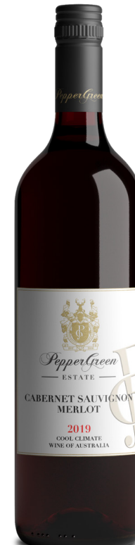
2019 Cabernet Sauvignon Merlot RRP $35

Deep red colour with garnet on the edge. The nose has sweet plums. Medium-full bodied. The palate is inviting with ripe plum flavours. The wine finishes with balanced acidity.