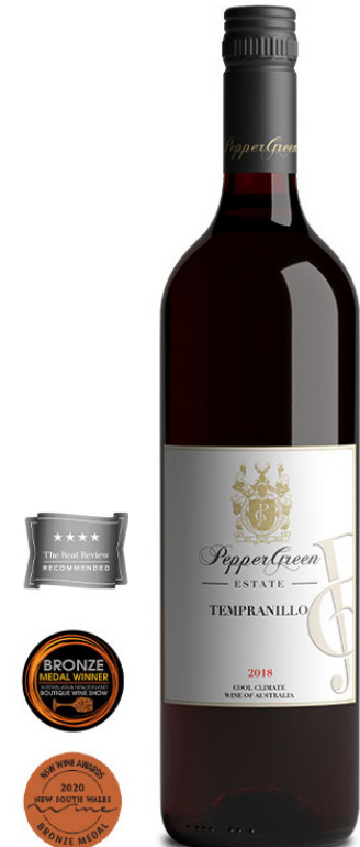
2018 Tempranillo RRP $32

Medium to deep purple red colour. Red and blue berries on the nose with subtle oak aromas. Medium bodied. Elegant palate with an abundance of berry flavours. Fine tannins. Drink now and over the next three years.