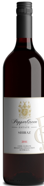
2016 Shiraz CCRC RRP $45

Deep red colour. The nose has red fruits, spices and black pepper. Full bodied. The palate has sweet red fruits. The wine finishes with balanced acidity.