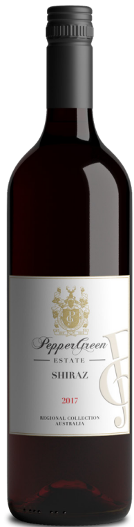
2017 Shiraz RC RRP $25

Deep red colour. Red fruits and spices on the nose. Medium body. Attractive flavours, following through with spices and ripe fruits, with good balance and positive tannins. Moderate length.