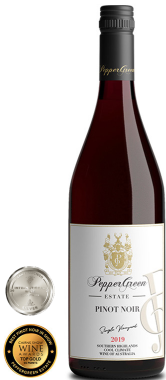
2019 Pinot Noir Single Vineyard RRP $45

Light-mid red with garnet tinges. Fragrant red cherry and raspberry on nose, with a little redcurrant. Intense, medium-bodied palate with plenty of fresh red fruits. Finishes with fine tannins, and a little refreshing acidity.