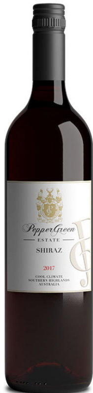
2017 Shiraz CESH RRP $30

Deep red colour. Red fruits and spices on the nose. Medium body. Attractive flavours, following through with spices and ripe fruits, with good balance and positive tannins. Moderate length.