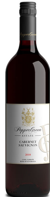
2018 Cabernet Sauvignon RRP $35

Mid-deep red. Blackcurrant and red fruits on nose with a little leafiness and vanilla from oak. Medium body. Good, firm Cabernet structure and flavour. Dark and red berries. Balanced, dry tannins and nice length.