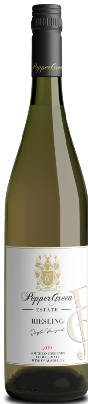
2019 Riesling Single Vineyard

Light, bright yellow colour. Intense nose with fragrances of a little citrus, stone fruit and distinct honey. The palate is similar to the nose. This wine finishes crisp and dry.