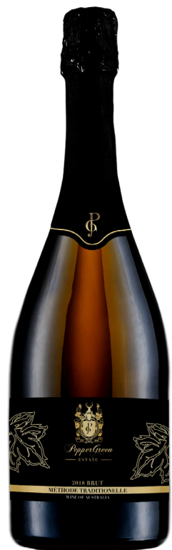
2018 Brut Méthode Traditionelle