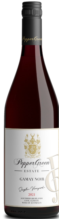
2021 Gamay Noir Single Vineyard RRP $30

Light-mid red with garnet tinges. Fragrant red cherry and raspberry on nose, with a little redcurrant. Intense, medium-bodied palate with plenty of fresh red fruits. Finishes with fine tannins, and a little refreshing acidity.