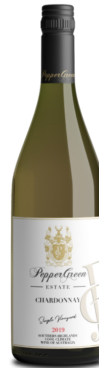
2019 Chardonnay Single Vineyard

Pale bronze/yellow. Fine, fragrant aromas of pear and white nectarine. Medium body, white stonefruit flavours.