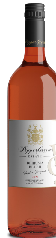
2021 Berrima Blush Single Vineyard