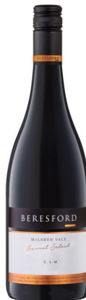
GSM 2016 Vintage GOLD MEDAL 2018 Perth Royal Wine Awards