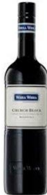
Wirra Wirra Church Block