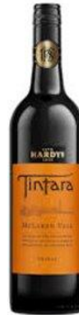
Hardy's Tintara McLaren Vale Shiraz