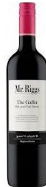
Mr Riggs The Gaffer McLaren Vale Shiraz