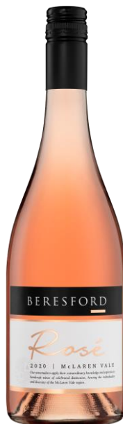
Rosé 2020 Vintage