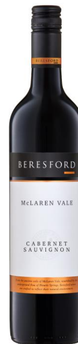
Cabernet Sauvignon 2017 Vintage 90 POINTS 2021 James Halliday Australian Wine Companion