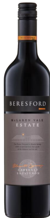
Cabernet Sauvignon 2015 Vintage

94 POINTS 2017 James Halliday Australian Wine Companion