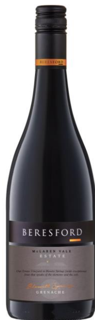
Grenache 2014 Vintage

Our Limited Release Shiraz is only released in years that yield exceptional quality. This is a tribute to the diversity of the McLaren Vale region and the uncompromising craftsmanship of our Chief Winemaker.