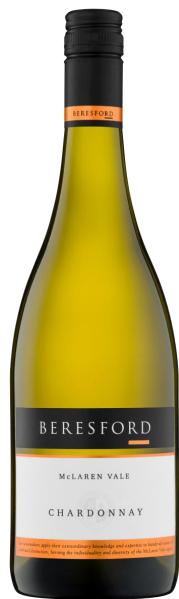
Chardonnay 2019 Vintage 4.5 STARS (Top in Category) WINESTATE McLaren Vale Tasting 2020

Our Beresford Classic range captures more than pure varietal expression. It captures the timeless elegance, powerful complexity and unique essence of McLaren Vale.