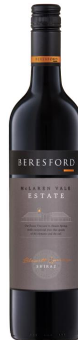
Shiraz 2016 Vintage

GOLD MEDAL 2018 New Zealand International Wine Competition GOLD MEDAL 2020 Sydney International Wine Competition