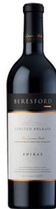
Shiraz 2014 Vintage

DOUBLE GOLD MEDAL 2018 San Fran International Wine Competition