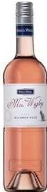
Wirra Wirra Mrs Wigley Grenache Rosé