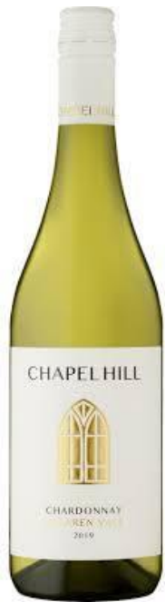
Chapel Hill Chardonnay