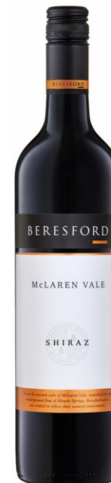
Shiraz 2017 Vintage DOUBLE GOLD MEDAL 2019 San Francisco International Wine Competition