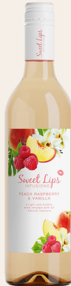
PEACH, RASPBERRY & VANILLA