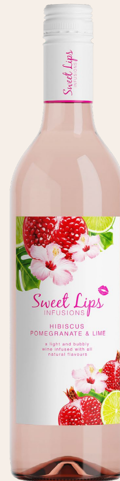
HIBISCUS, POMEGRANATE & LIME