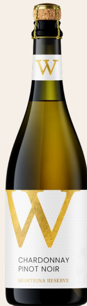
CHARDONNAY PINOT NOIR