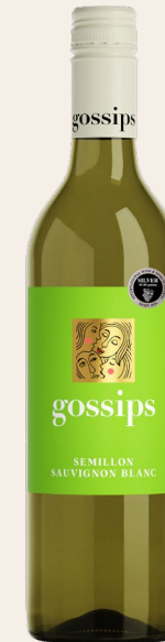
SEM SAUV BLANC