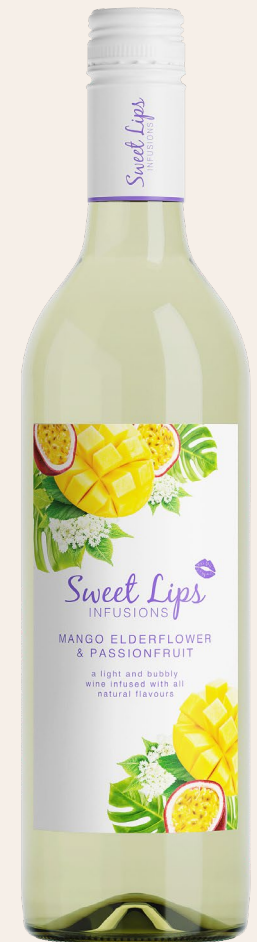
MANGO, ELDERFLOWER & PASSIONFRUIT