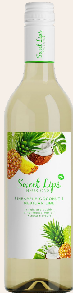
PINEAPPLE, COCONUT & MEXICAN LIME

These wines are the perfect accompaniment to any occasion, transforming the ordinary into extraordinary. Elevate your gatherings from events to memories with a splash of our spirited elixirs.