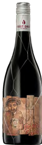
'DOS POR CIENTO (2%)' SHIRAZ MOSCATEL