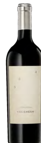
'THE CREAM' BAROSSA SHIRAZ