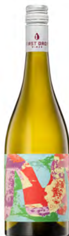
'REAL TIME' CHARDONNAY