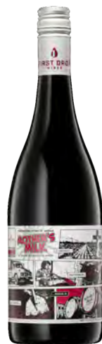
'MOTHER'S MILK' SHIRAZ