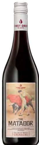
'THE MATADOR' GRENACHE

2018 'Fat of the Land' Ebenezer Shiraz - 95 Points 2018 'The Cream' Barossa Shiraz - 95 Points 2020 'Cold Sweat' Mocolta Syrah - 95 Points