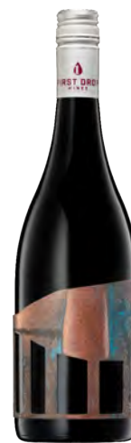
'COLD SWEAT' EDEN VALLEY SYRAH SERIES