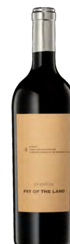
'FAT OF THE LAND' BAROSSA SHIRAZ SERIES