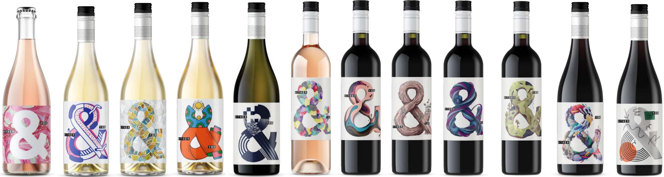
2024 PETIT ROUGE