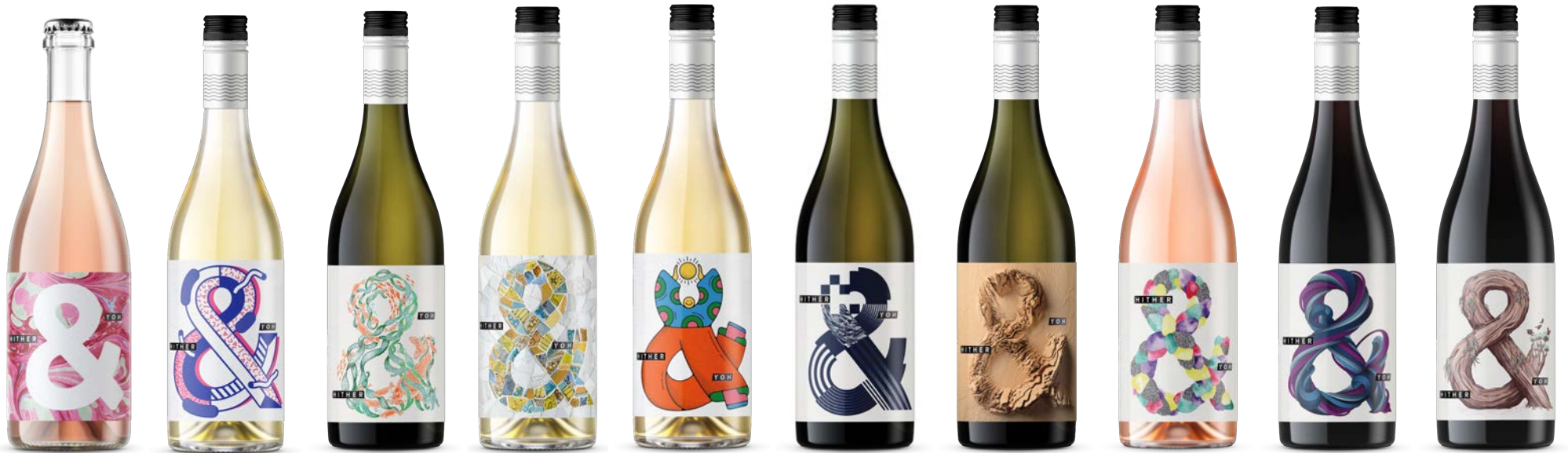
NV PETIT ROUGE