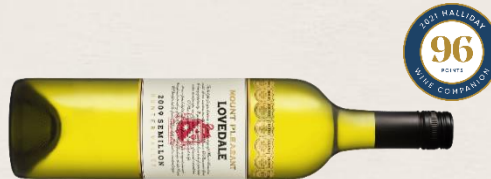
2013 Lovedale Semillon

2017 Maurice O'Shea Shiraz – 98pts 2014 Maurice O'Shea Shiraz – 99pts