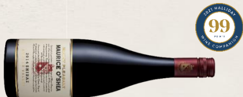
2018 Maurice O'Shea Shiraz Top 100 Wines of 2020

An utterly stupendous wine, in the same league as Penfolds 1962 Bin 60A. This O'Shea has the complexity of a great tapestry woven centuries ago when time was of no consequence. The sky, the soil and the fruit coalesce into an entity that throbs with intensity and a never-ending kaleidoscope of blackberry, earth and leather flavours.