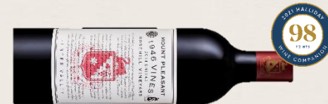
2018 "Block" 1946 Vines Shiraz

2011 Lovedale Semillon – 97pts 2010 Lovedale Semillon – 97pts 2007 Lovedale Semillon – 98pts & Semillon of the Year