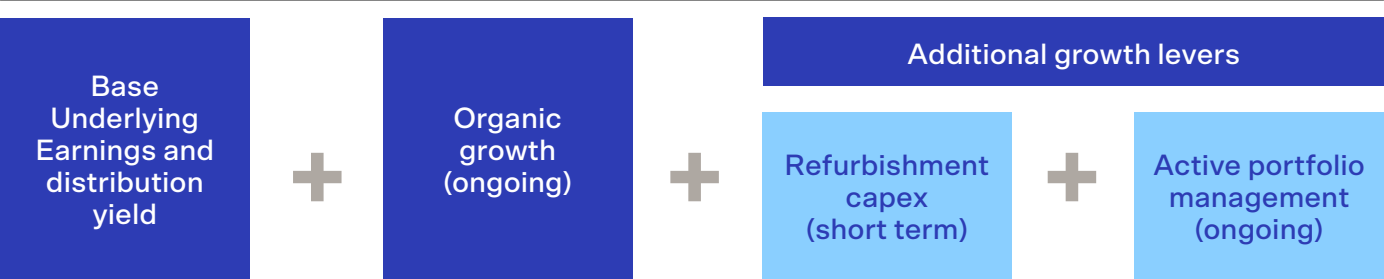
FIGURE 1: YIELDS PLUS INDUSTRY GROWTH

The Fund seeks to deliver regular distributions and the potential for earnings and capital growth underpinned by a Portfolio of 27 hotels (as at the date of this PDS). The Fund is targeting organic growth within the business, plus potential capital and earnings growth from active portfolio management, including investment in the refurbishment or redevelopment of Fund assets.