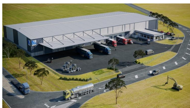
67-73 & 75 Kaurna Ave, Edinburgh SA – artist's impression