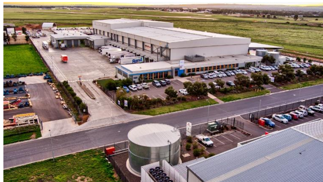
16-26 Caribou Drive, Direk SA