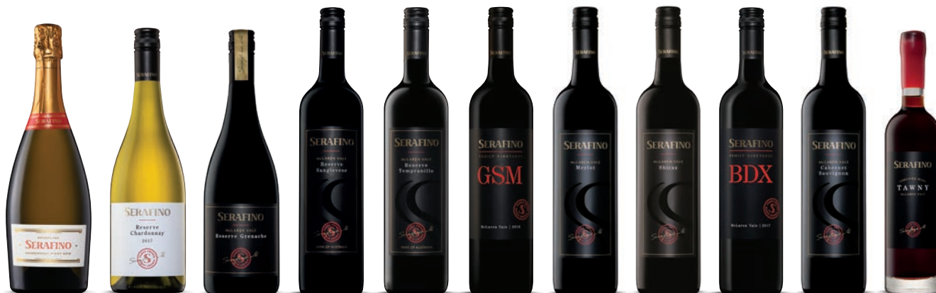
Premium Sparkling Chardonnay Pinot Noir

Serafino black label wines are selected from estate grown individual vineyard blocks in McLaren Vale. The diverse mix of soil types and vineyard orientation enhances the complexity of each black label wine, providing distinctive varietal and regional characters.