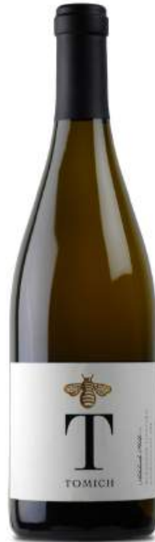
2019 Q96 Chardonnay 95 pts