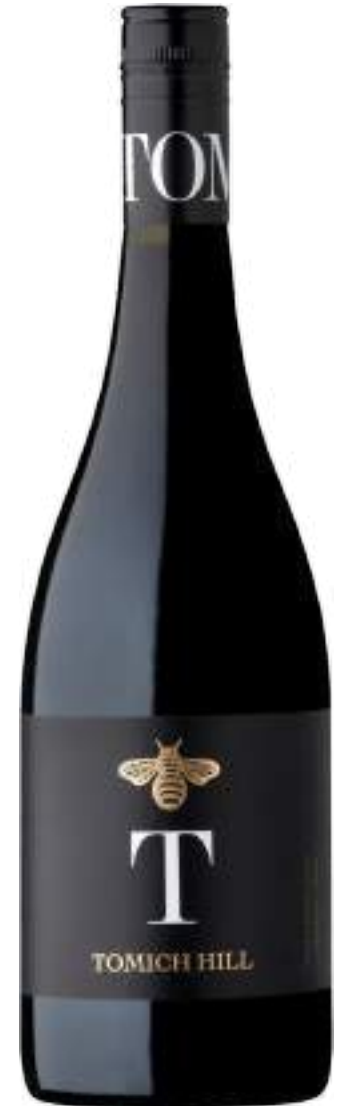
2018 McLaren Vale Shiraz 93 pts