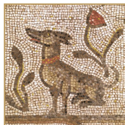
SORTER Pinto Gris

King Arthur's dog Cavall was said to have left his pawprint in a stone while he and Arthur were hunting the great Boar in Wales. Arthur honoured his canine friend by erecting a monument and placing the paw print stone on top. People would come and take the stone as a souvenir but the next day it would return to its rightful position, just as a dog will always return to its master.