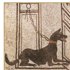
ANUBIS Cabernet Sauvignon