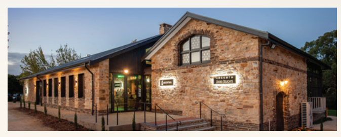
Grünthal - the home of Hesketh Wines in Verdun in the Adelaide Hills.

Fruit for the Hesketh range of wines is sourced from our own vineyards in Coonawarra and the Adelaide Hills, as well as specialist growers in South Australia's cool climate growing regions.