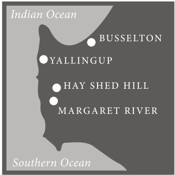
MAP OF MARGARET RIVER WINE REGION