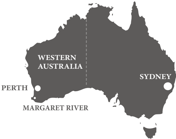
MAP OF AUSTRALIA

The Margaret River Wine Region is located in the far south west corner of Western Australia and is one of the most geographically isolated and pure wine regions in the world.