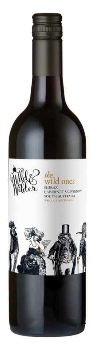
the wild ones SHIRAZ, CABERNET SAUVIGNON SOUTH AUSTRALIA

We're delighted to introduce the latest addition to our coterie of wines. Parading out in all their glory, the Wild Ones are a sight to behold. Elegant, refined and a just a little bit mischievous. Beautiful wines, larger than life characters all in one gregarious package.