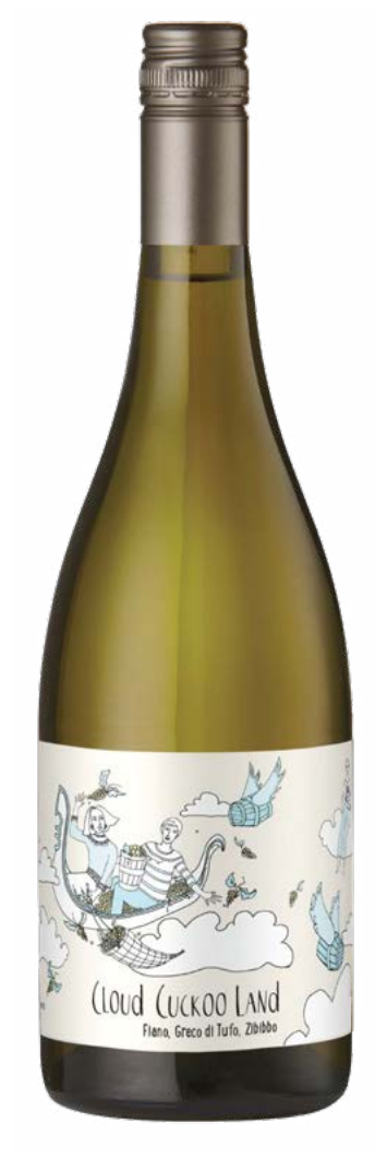
Fiano, Greco, Zibibbo

An unusual blend of varieties but this wine has the characteristic energy you'd expect from Italian reds. Deliciously succulent with smoky, dark cherry fruit, subtle spice and a mouth-watering finish.