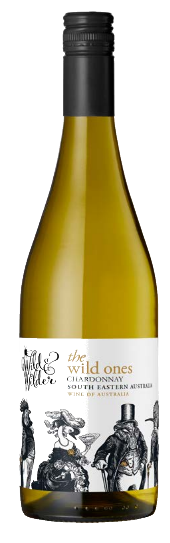
the wild ones Chardonanay SOUTH EASTERN AUSTRALIA