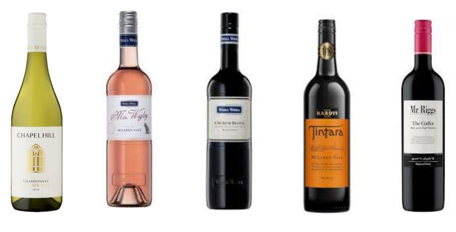
Chapel Hill Chardonnay