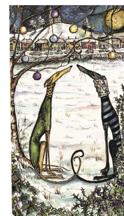
BAROSSA MERLOT CABERNET SAUVIGNON CABERNET FRANC