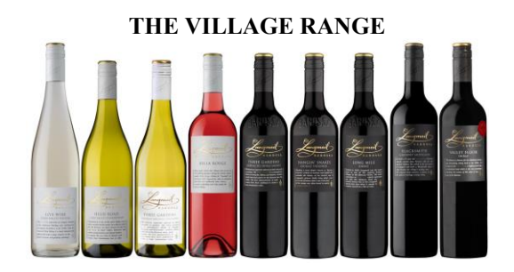
This range includes our Live Wire Riesling and High Road Chardonnay from Eden Valley, our Three Gardens Viognier Marsanne Roussanne, Bella Rouge Rosé, Three Gardens GSM, Hangin' Snakes Shiraz Viognier, Long Mile Shiraz, Blacksmith Cabernet Sauvignon, and our Valley Floor Shiraz