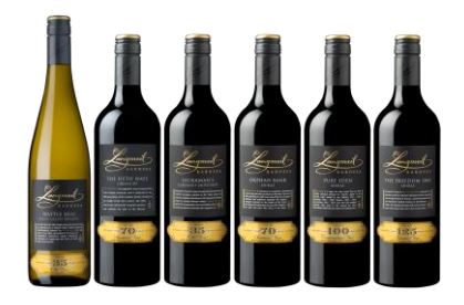
Wattle Brae Eden Valley Riesling, Jackaman's Cabernet Sauvignon, The Fifth Wave Grenache, Orphan Bank Shiraz, Pure Eden Shiraz and The Freedom 1843 Shiraz