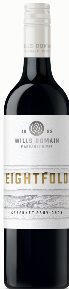
Wills Domain Eightfold Margaret River Cabernet Sauvignon