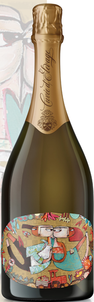
Wills Domain Cuvée d'Elevage Margaret River NV Blanc de Blanc