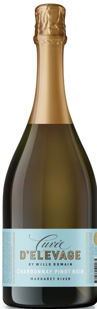
Wills Domain Cuvée d'Elevage Margaret River NV Chardonnay Pinot Noir