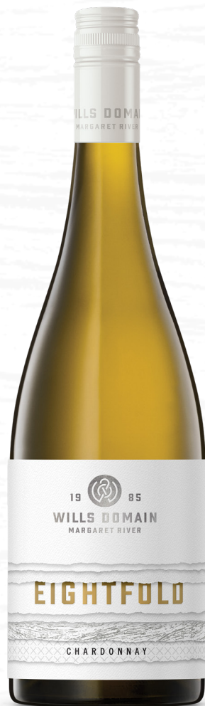
Wills Domain Eightfold Margaret River Chardonnay