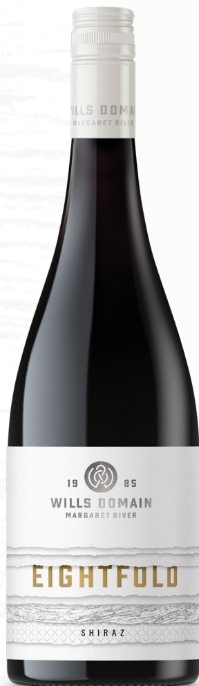
Wills Domain Eightfold Margaret River Shiraz