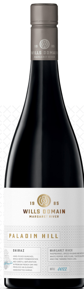
Wills Domain Paladin Hill Margaret River Shiraz