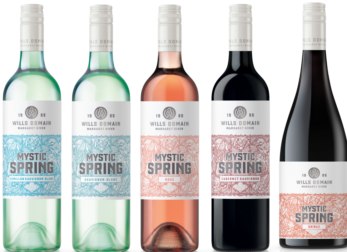
Wills Domain Mystic Spring Margaret River Semillon Sauvignon Blanc