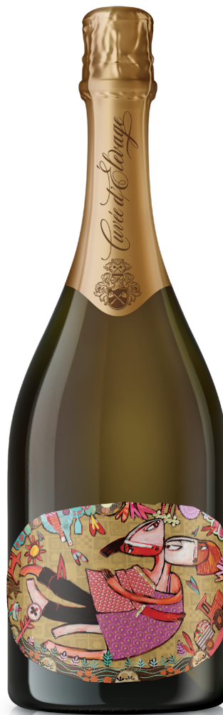
Wills Domain Cuvée d'Elevage Margaret River NV Sparkling Rose