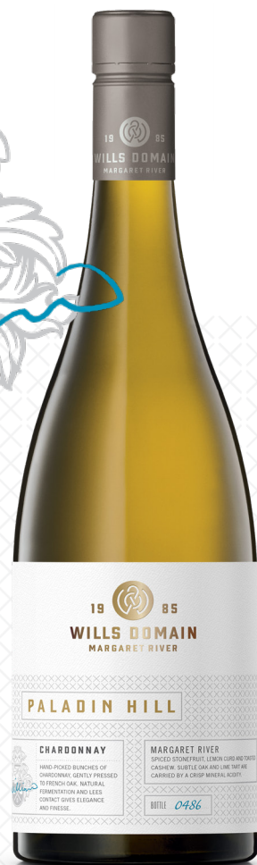
Wills Domain Paladin Hill Margaret River Chardonnay