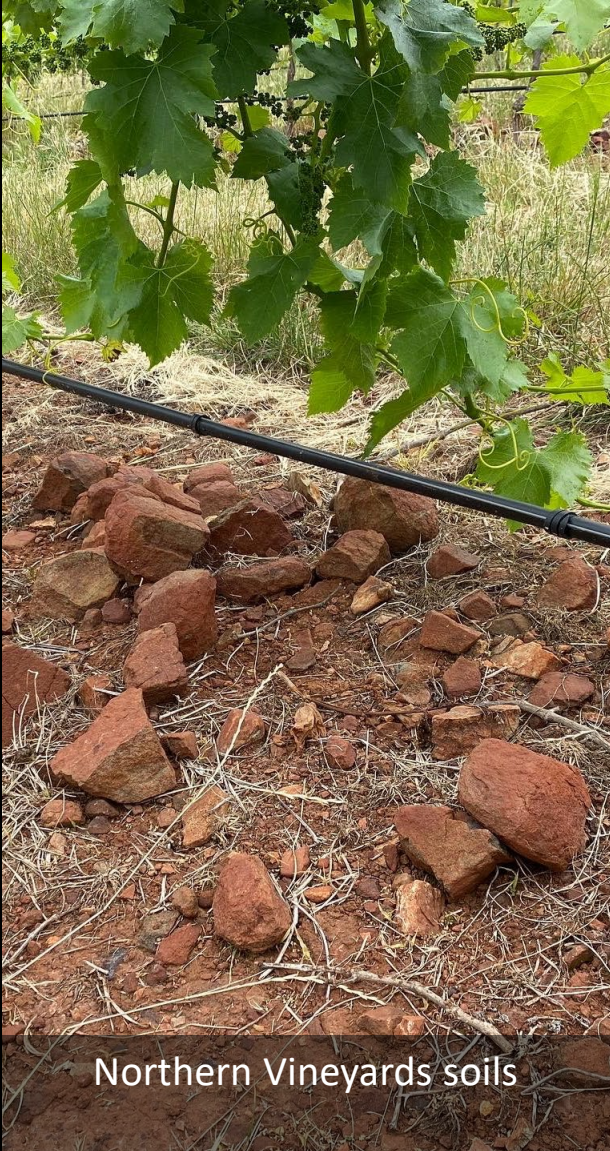
Northern Vineyards soils