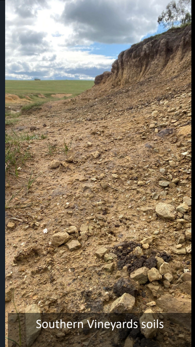
Southern Vineyards soils

Clay loam soils over mudstone and sandstone. Formed through the melting of a glacier during the Ordovician Period some 350 million years ago.