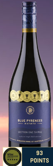
2018 Section One Shiraz