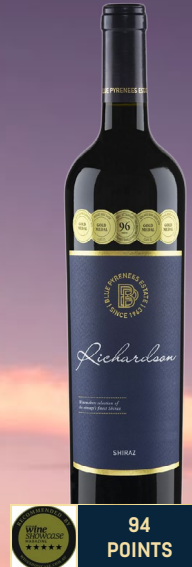
2018 Richardson Shiraz