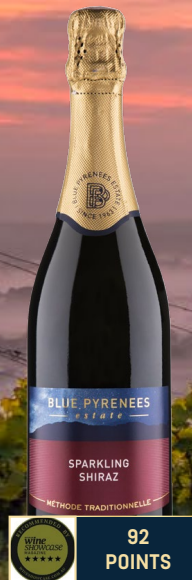
2018 Sparkling Shiraz