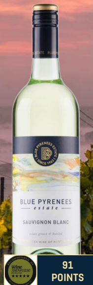
2020 Sauvignon Blanc