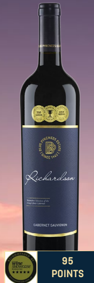
2018 Richardson Cabernet Sauvignon

Other editorial content includes detailed stories on regional and varietal differences of Australian wines showcased, profiles on winemakers and wineries, the latest news about Australian wines and their accolades on the Wine Show Circuit around the globe.