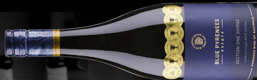
2018 Section One Shiraz - Silver