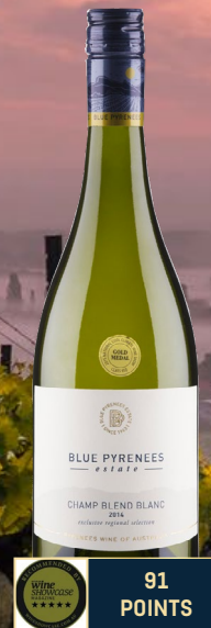
2015 Champ Blend Blanc