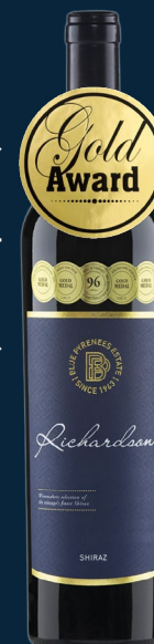
2017 Blue Pyrenees Estate Shiraz