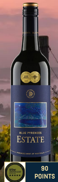
2018 Estate Red