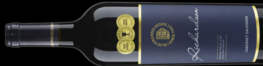
2018 Richardson Cabernet Sauvignon - Silver