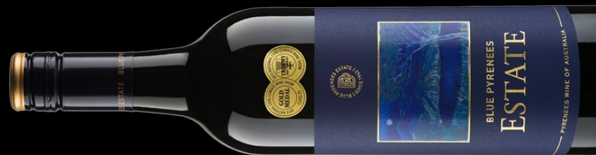
2017 Estate Red - Gold Medal