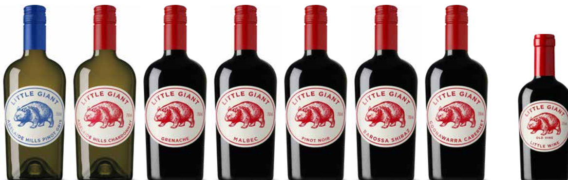
Wines Pinot Gris, Chardonnay, Grenache, Malbec, Pinot Noir, Shiraz, Cabernet Sauvignon Regions Adelaide Hills, Barossa, Coonawarra, South Australia Seal Screwcap Case 6pk

A GIANT PERFORMER: LEADING MARKET GROWTH $16+