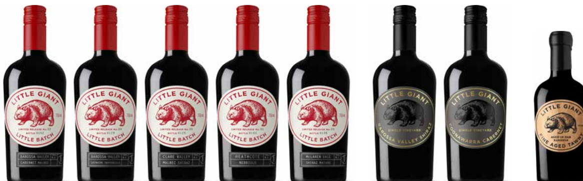
Wines Cabernet Malbec, Grenache Tempranillo, Malbec Shiraz, Nebbiolo, Shiraz Mataro Regions Barossa Valley, Clare Valley, Adelaide Hills, McLaren Vale Seal Screwcap Case 6pk