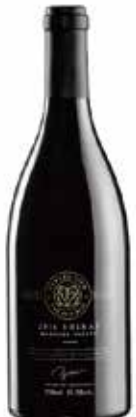
The Old Man Wisdom That Only Comes with Age