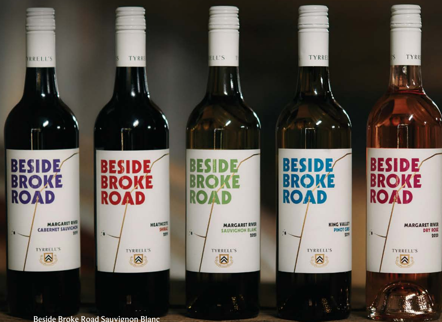
Beside Broke Road Sauvignon Blanc

While Tyrrell's is synonymous with the Hunter Valley, we have a long history of bringing our customers wines from beyond our spiritual (and actual) home. Our Beside Broke Road range is comprised of wines sourced from premium regions around Australia where the combination of grape variety, climate and soil is ideal, ensuring that the wines show excellent varietal and regional character. One of life's great pleasures is discovering something new, so when you're looking to broaden your wine horizons, go Beside Broke Road.