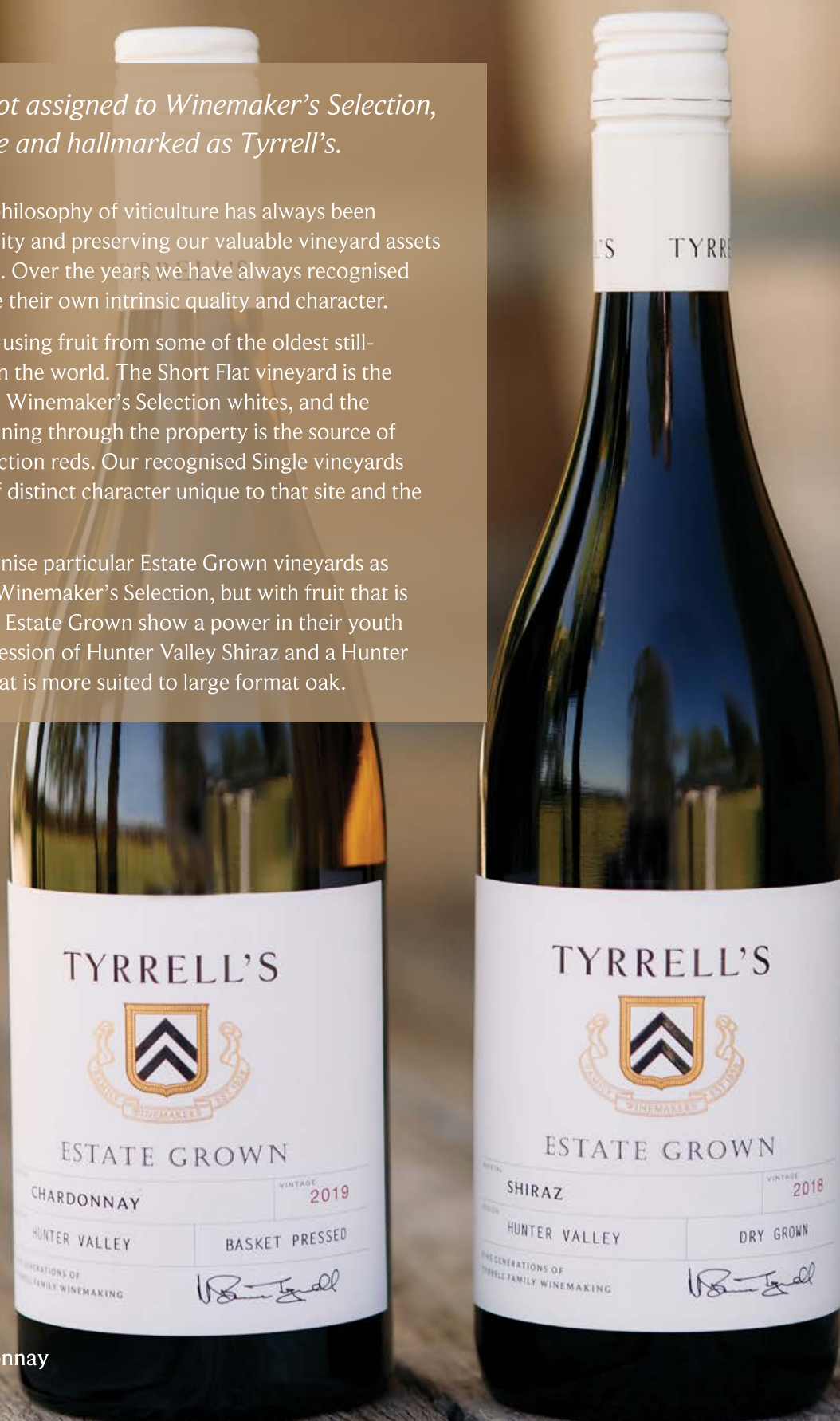
Estate Grown Chardonnay

Tyrrell's further recognise particular Estate Grown vineyards as having the quality of Winemaker's Selection, but with fruit that is not of a style that fits. Estate Grown show a power in their youth that has a bigger expression of Hunter Valley Shiraz and a Hunter Valley Chardonnay that is more suited to large format oak.