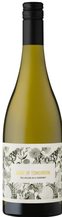
2024 Adelaide Hills Chardonnay RRP $45.00