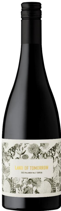
2023 McLaren Vale Touriga RRP $35.00