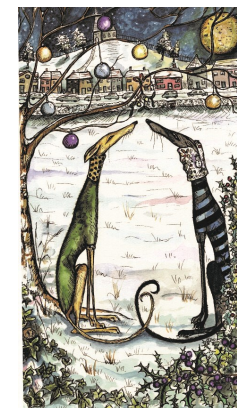
BAROSSA MERLOT CABERNET SAUVIGNON CABERNET FRANC