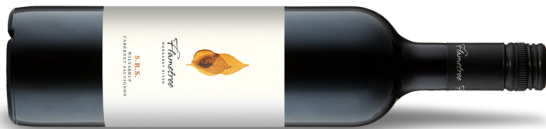
SRS Cabernet Sauvignon