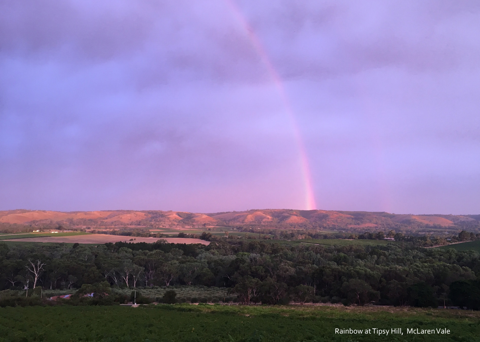
Rainbow at Topsy Hill, McLaren Vale