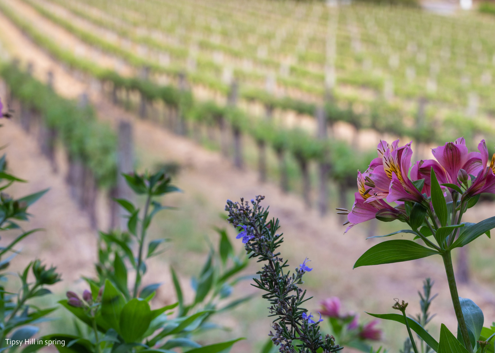
Tipsy Hill in spring