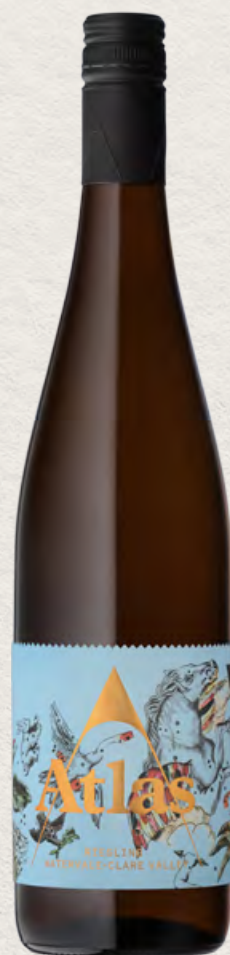
ATLAS WATERVALE RIESLING