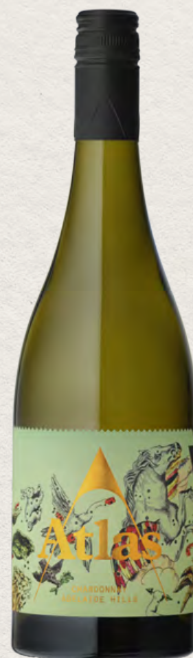
ATLAS ADELAIDE HILLS CHARDONNAY