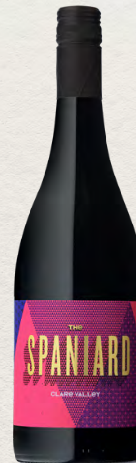
ATLAS THE SPANIARD