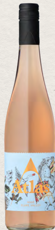
ATLAS CLARE VALLEY ROSÉ