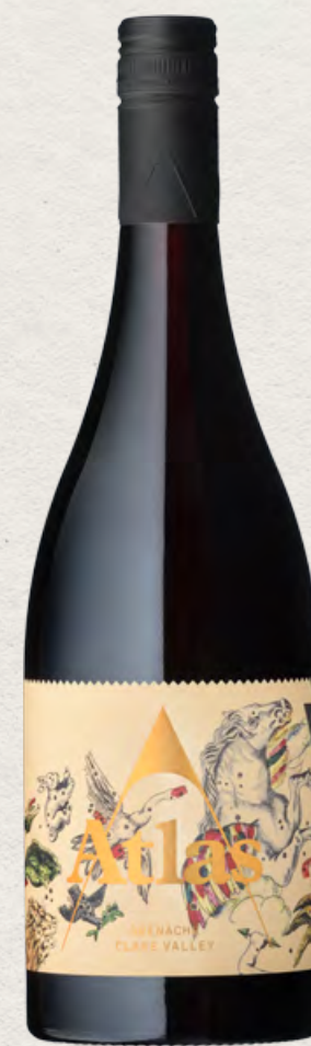
ATLAS CLARE VALLEY CRENACHE