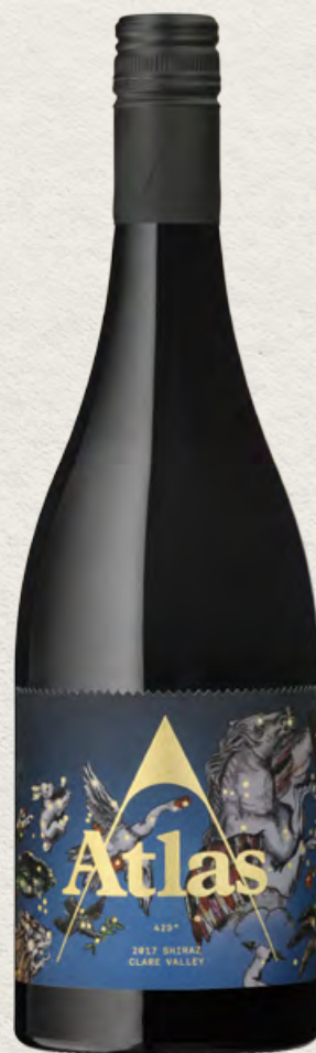
ATLAS 516° BAROSSA VALLEY SHIRAZ