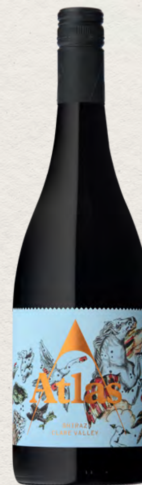
ATLAS CLARE VALLEY SHIRAZ