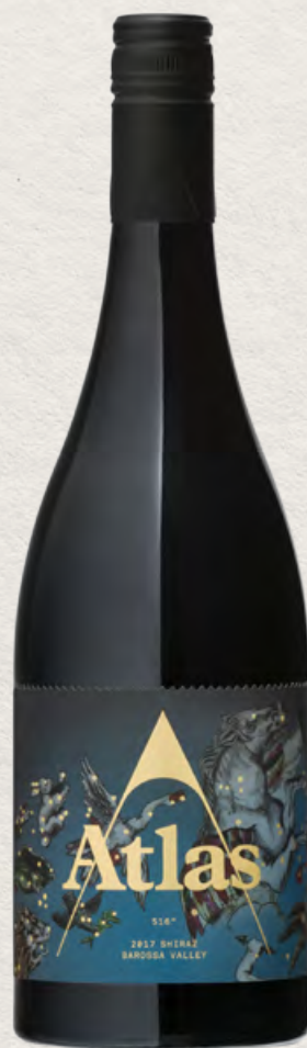
ATLAS 429° CLARE VALLEY SHIRAZ