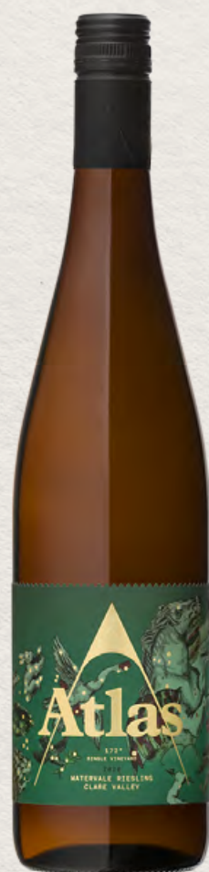
ATLAS 172° WATERVALE RIESLING