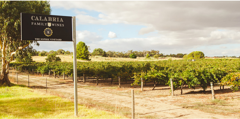
TOP-BOTTOM: Calabria Family Wines Barossa Valley Cellar Door 100 Year Old Vines at The William Vineyard The picturesque Sophie Vineyard containing 70 year old vines