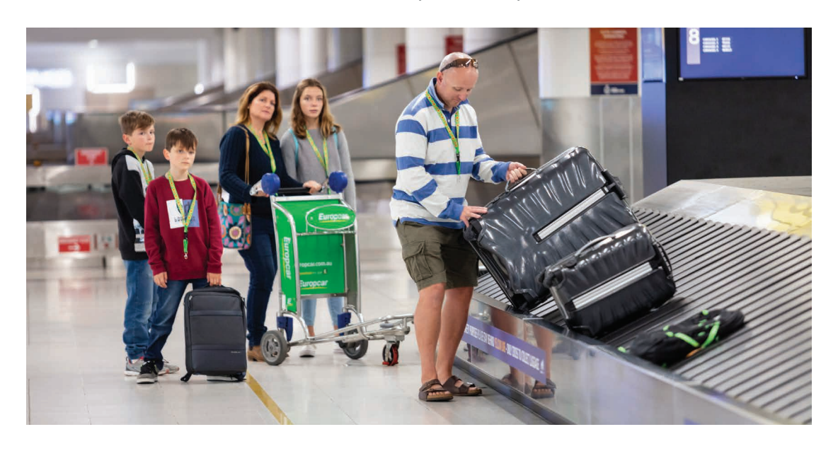
When I have all my bags I can join the queue and show the officers my yellow arrivals card.

When I see my bag, I will pick it up off the carousel.