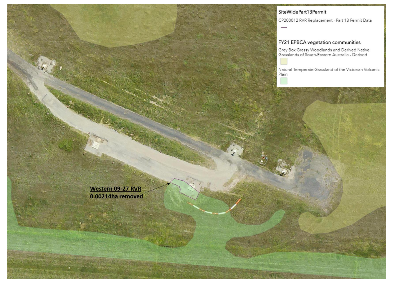
Figure 1: Western 09-27 RVR Site

Figures 1-4 outline the locations where 0.09214 hectares of NTGVVP and 0.045 hectares of GBW were removed during the project. Figures 5-6 confirm no NTGVVP or GBW were removed at the remaining two RVR sites.